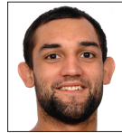
Johnny Hendricks • 2X NCAA Champion • 4X All American • UFC Fighter